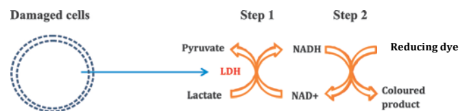
Fig 1: Schematic representation of measurement of LDH released from damaged cells

Enzyme in the LDH reagent uses NADH to reduce the dye to a coloured product which can be measured either colorimetrically or fluorometrically.